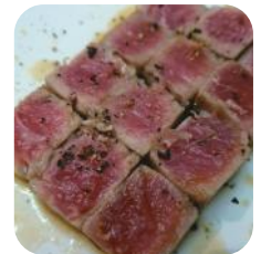
Cooked dish, heat-stable