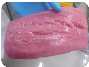
Initial cracked tuna fillet