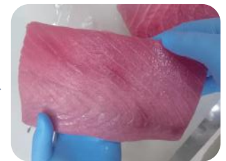
Result: Fixed fillet, quality whole cut