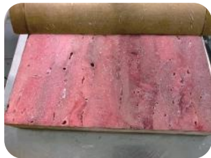
Processing & Molding