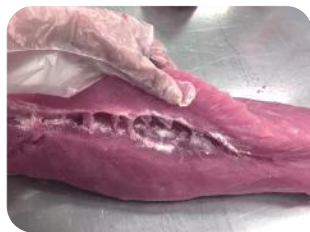
Spread Prolink FB-FC powder or brush Prolink FB-FC slurry into the fillet cracks