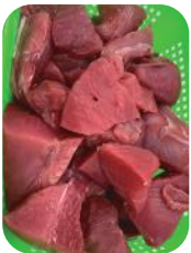
Raw materials - cutoffs