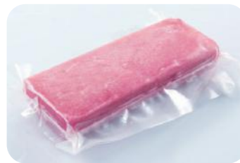
Vacuum & Store overnight in chilled room